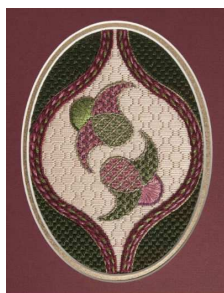
Ottoman Triad I