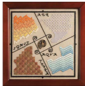
Earth Air Fire & Water