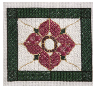
Stained Glass Jewel